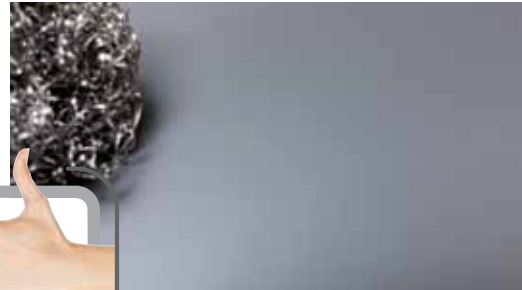
Supermatte ZENIT after abrasion