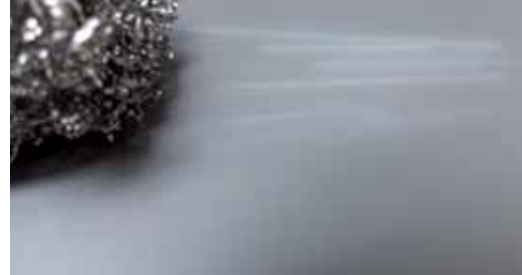
Supermatte PET after abrasion

In practice, these characteristics result in a product with outstanding properties that will remain intact throughout the useful life of the product.